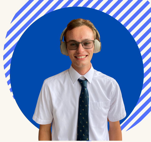
read about Gage on page 3!